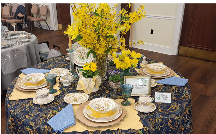
Flowers of Friendship Betsy Bellingham

see more photos on our Facebook page Facebook.com/WheelsforWellness