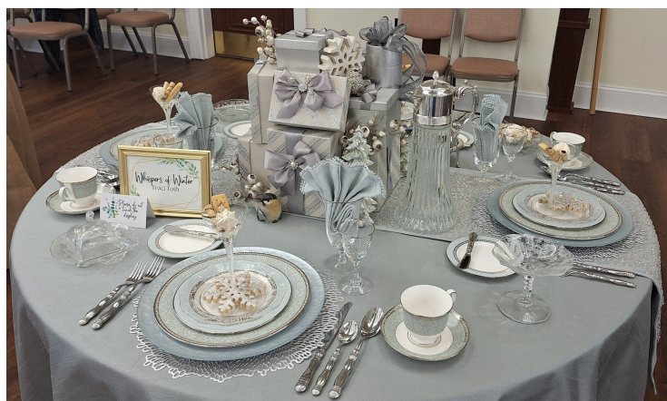
Whispers of Winter Traci Toth