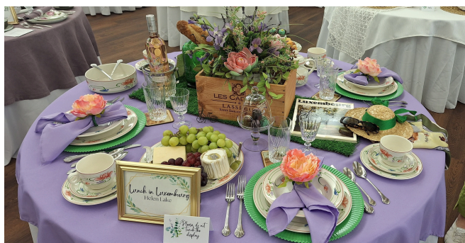
Lunch in Luxembourg Helen Lake