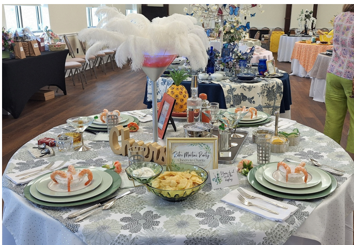
Retro Martini Party Cheers to Charity